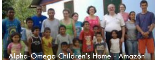
Alpha-Omega Children’s Home - Amazon